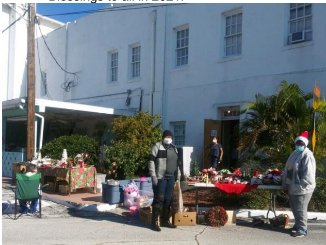
Clothes Closet volunteers sharing Christmas items with local residents.

"Do all the good you can. By all the means you can. In all the ways you can. In all the places you can. At all the times you can. To all the people you can. As long as ever you can." - John Wesley